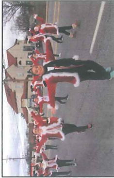
LeRoux School of Dance