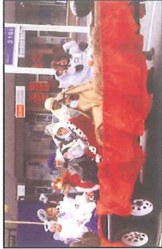
Penn Christian Academy Float

Laurel House's shelter has long been known as a safe place to heal. However, for numerous decades, our programs have expanded to include many other needed services and support resources. Today, in addition to our 24-hour hotline and shelter, Laurel House offers transitional housing, medical advocacy, legal advocacy, counseling and support groups, children's programs, law enforcement collaboration, and expanded community education and prevention efforts.